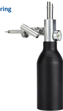
Figure 5: Argon gas cylinder

One argon canister can perform to carry out 100 excitations. A portable gas cylinder comes with the CALIBUS instrument (figure 5). It is used for topping up the argon canister (up to 5 times). This means 500 tests can be continuously performed on site.