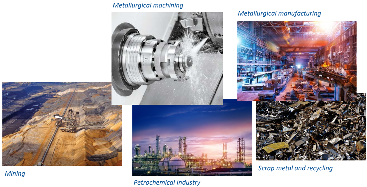
Figure 1: Examples of where the CALIBUS has been used.

The new CALIBUS is an ideal analytical solution for QA/QC, metallurgical manufacturing and machining, petrochemical industries, mining, scrap metal and recycling (figure 1).