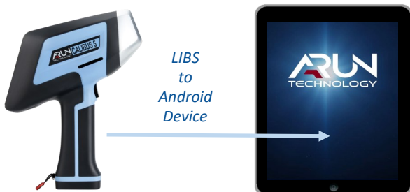
Figure 7: Data transfer between LIBS and Android device

The smart phone and tablet interactive interface makes the CALIBUS more convenient to use. It has a 5-inch colour, high resolution touch screen that is protected with a super impact-resistant glass material.