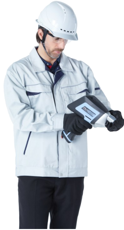
Figure 4: Illustrating appropriate safety goggles being worn during testing

Its portability and weight at approximately 2kg, makes it easy to use in any situation and environment.