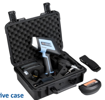
Figure 6: Portable protective case