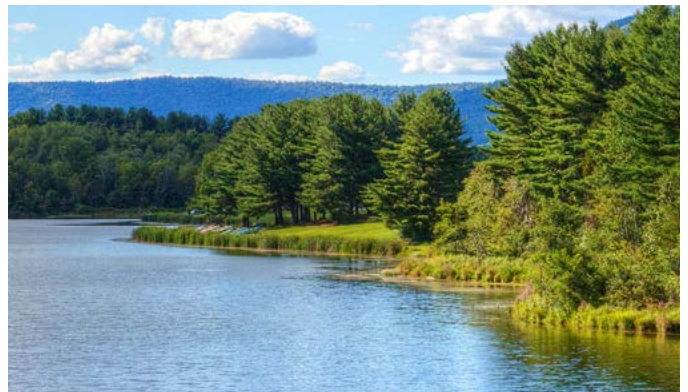
Environmental & Plant