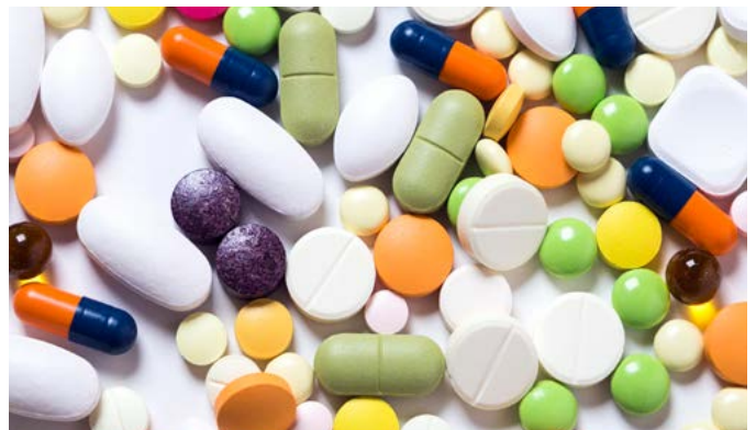
Nutraceuticals & Pharmaceuticals