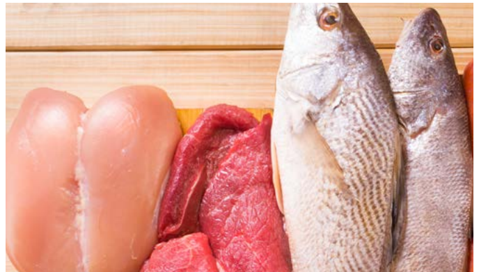
Fish & Animal Tissue