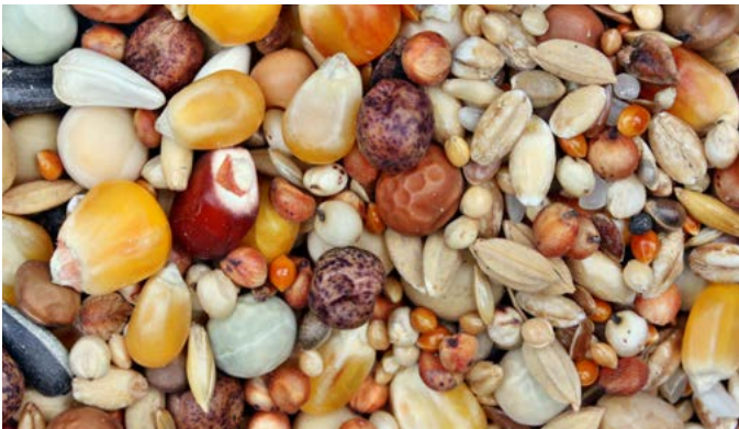
Feed & Grain